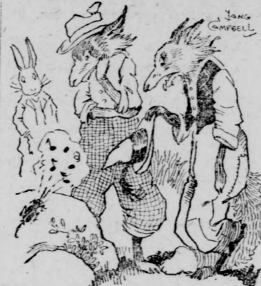
The cricket began to chirp and sing.

Once upon a time, when Uncle Wiggily was out walking with Woodie and Waddie Chuck, the groundhog boys, they saw the bunny gentleman suddenly stop and give a little hop, as though he had jumped over a stone.